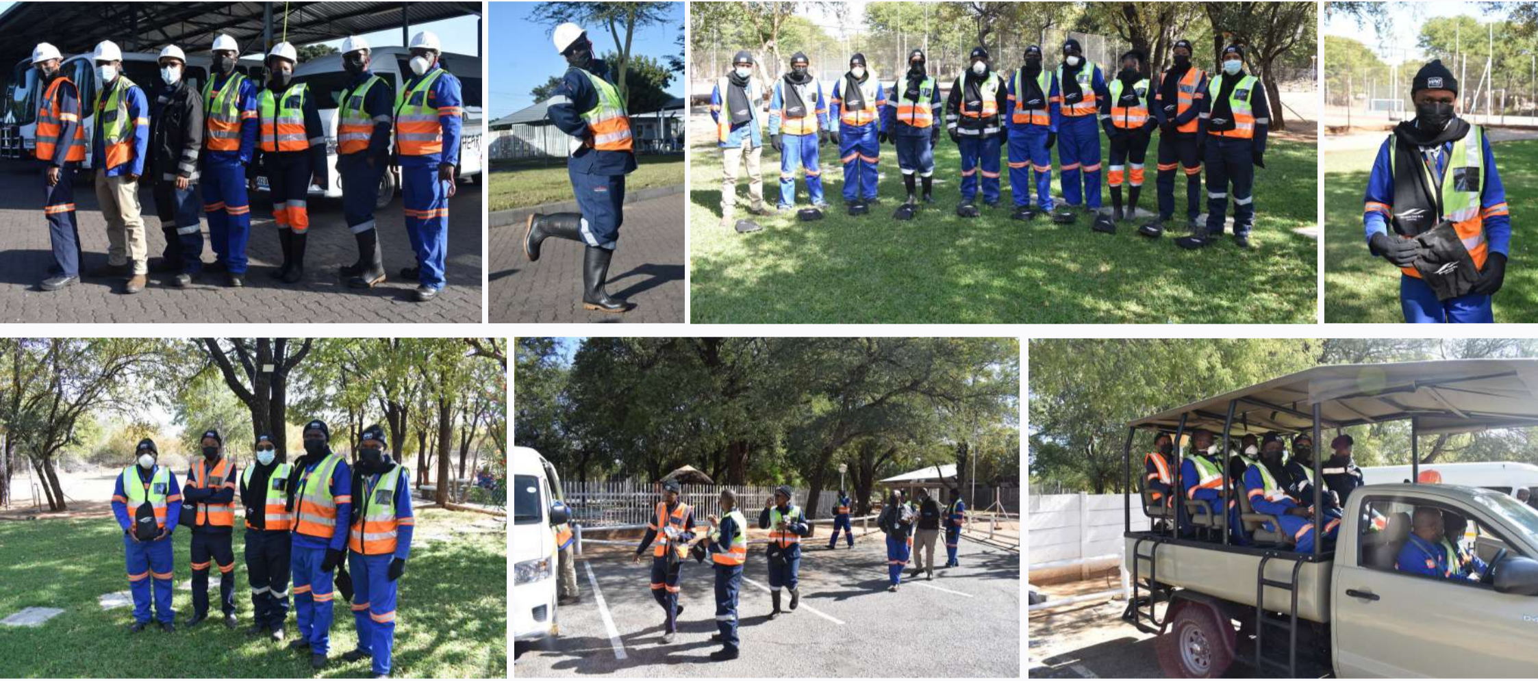
The Corporate Affairs section continues take employees on a Mine Tour for them to see and appreciate the underground operation and Motheo Project opencast mine. The tours are a refresher and a first for some who are surface workers. This week the tour was different as the tourists were taken into the game park to also appreciate what MCM has to offer other than coal.