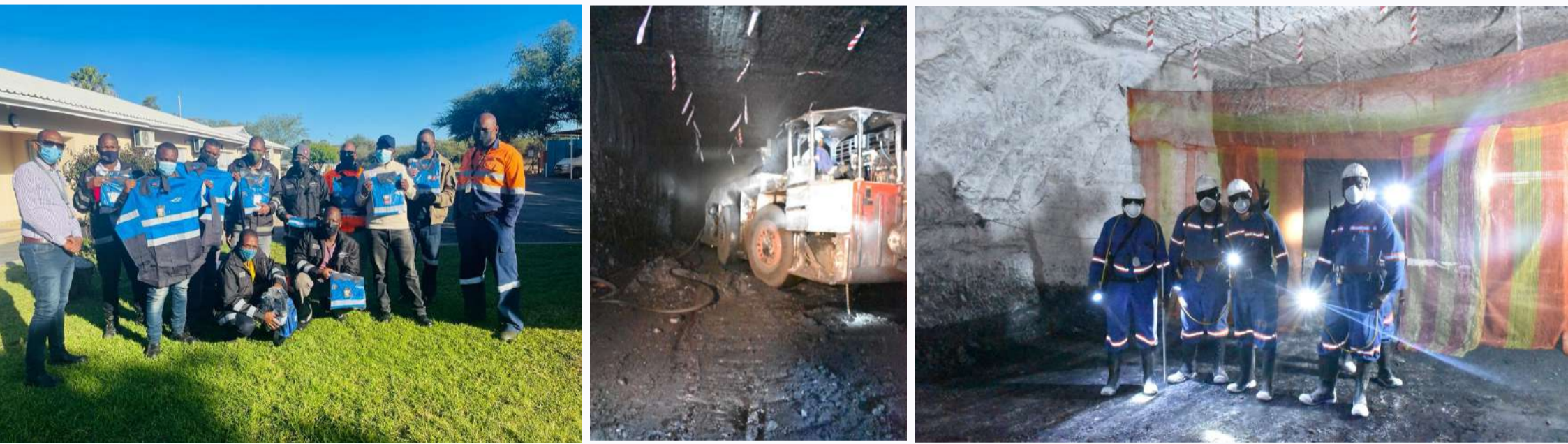
MCM management and SHE department has seen it fit to award Makanyane MBA for excellence. The team was found to have done an excellent work during the VFL visit at EM 1/7 section. Some of the good deeds were adherence to mining standards, i.e. support, barring down and fire fighting equipment which were up to standard and serviced. Other teams are encouraged to benchmark and improve their sections.